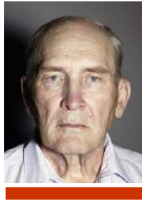
3) incorrect: directional light, shadow