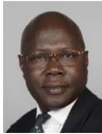
2) incorrect: shoulders askew