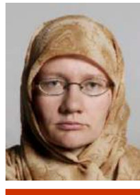
7) incorrect: shadows across face