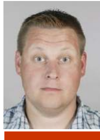
3) incorrect: raised eyebrows