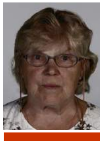
6) incorrect: underexposed