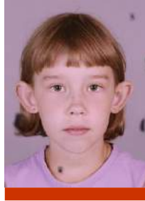
2) incorrect: unnatural colour, stains