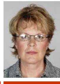
9) incorrect: reflections on glasses