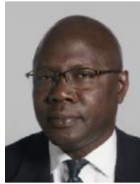
3) incorrect: head sideways