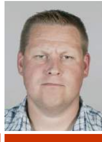
4) incorrect: squinting