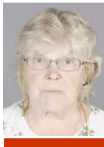
5) incorrect: overexposed