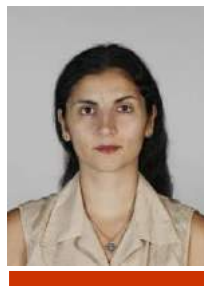
4) incorrect: too far away