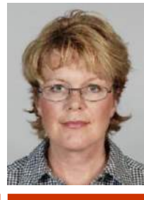
8) incorrect: frames covering eyes