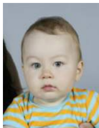
7) incorrect: shows another person