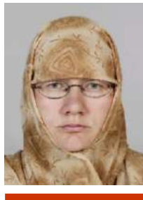
6) incorrect: forehead covered