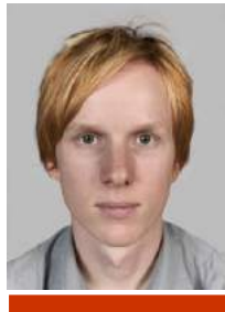
5) incorrect: optical distortion