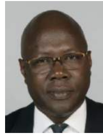
4) incorrect: head tilted