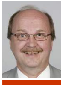
2) incorrect: mouth open