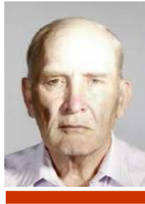
2) incorrect: hot spot on the forehead