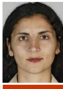
5) incorrect: too close